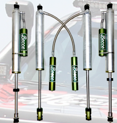
TOYOTA LN 106 +55MM