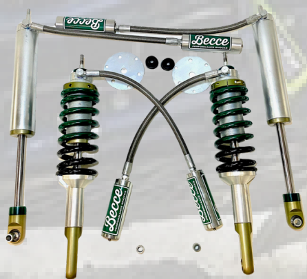
MITSUBISHI PAJERO +55MM