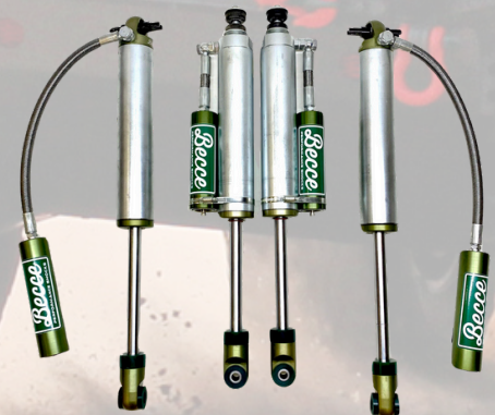
RUBICON JK +55MM