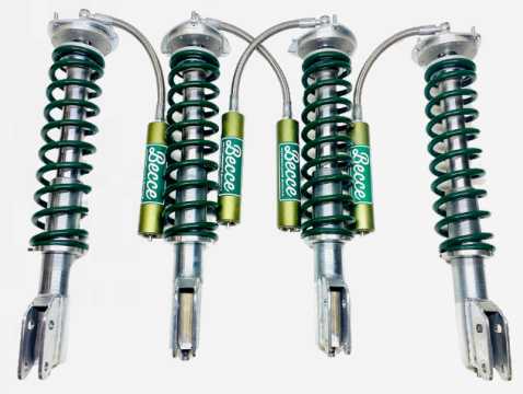
SUBARU FORESTER RALLY +55MM