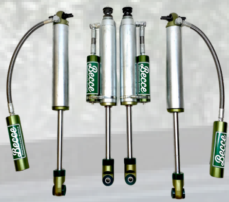
RUBICON JK +100MM