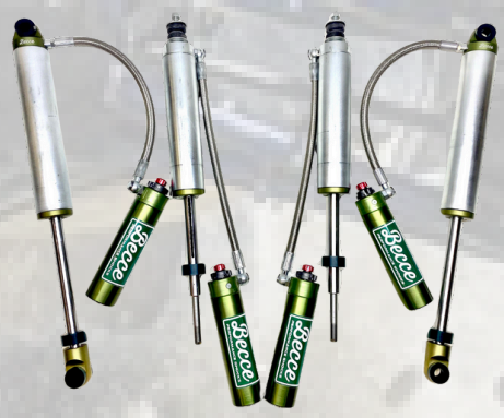
NISSAN PATROL +55MM