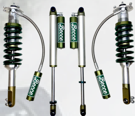
TOYOTA HILUX REVO +55MM