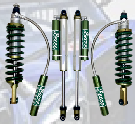
FORD RANGER +55MM