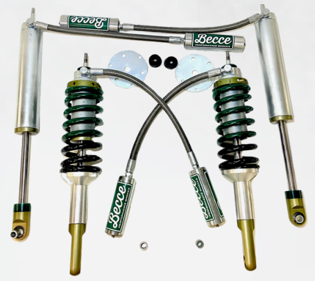
MITSUBISHI TRITON/L200 +55MM