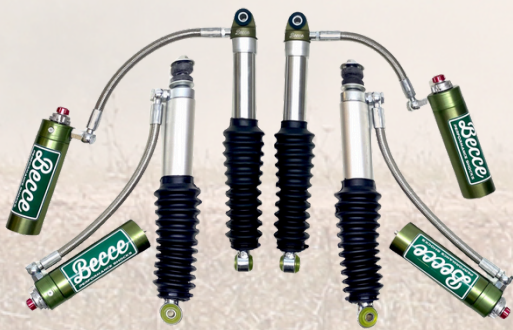
SUZUKI JIMNY HIGH PERFORMANCE KIT