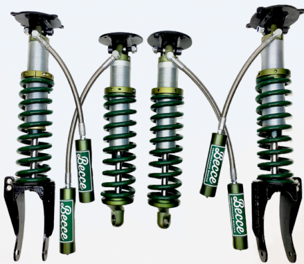
PORSCHE CAYENNE/TOUREG + 55MM

Kits for all vehicles are tested in real life conditions during expeditions and races to maximize the performance for each and every brand. We use the same technology and material when building our bolt-on kits as we use in our high-end performance shocks.