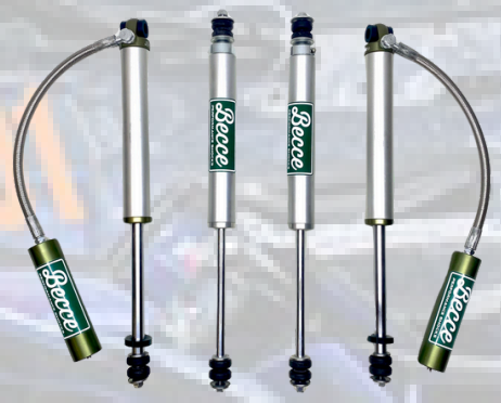
LAND ROVER DEFENDER ECO +55MM