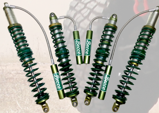
YAMAHA YXZ 1000R