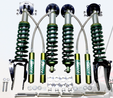
PORSCHE CAYENNE/TOUREG + 100MM