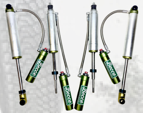
NISSAN PATROL +100MM